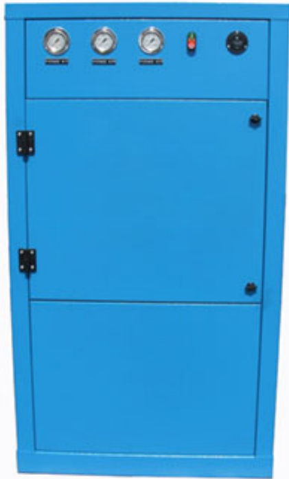
E3-5-A AIR COMPRESSOR (PICTURED)

83 Outer Drive Silver Bay, Minnesota 55614 (218) 226-4695 (800) 526-6395 Fax (218)226-3440 info@northshorecompressor.com